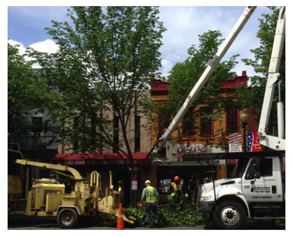
Figure 8. Princeton elm being removed in Barracks Row. Photo credit: Timothy Hoagland, May 2013