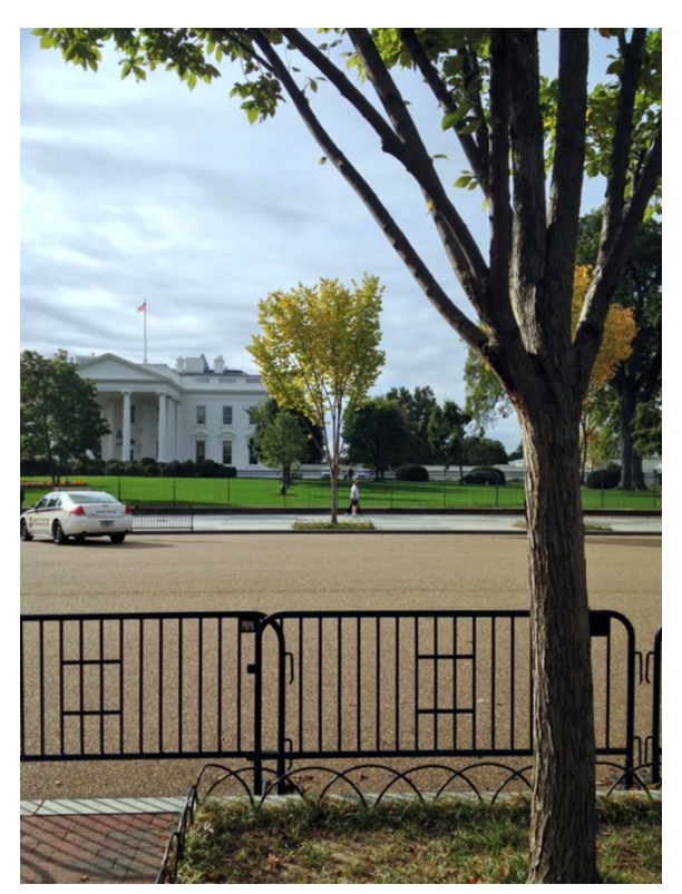
Figure 3. American elms in front of the White House at 1600 Pennsylvania Avenue Photo credit: Joseph Duszak, October 2013