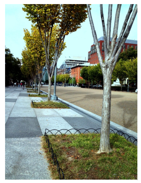
Figure 5. Heavily pruned and lion-tailed elms in front of the White House at 1600 Pennsylvania Avenue.

The corresponding planting at 1600 Pennsylvania Avenue offers a unique perspective on street-tree management, as its elms also demonstrated the same co-dominant elm structure at planting. However, aggressive corrective pruning carefully managed by NPS may have achieved improved structure and scaffold branching associated with classic American elms (Figure-5). Additionally, the high-profile location of this planting has and will continue to receive careful scrutiny in perpetuity, including annual inspections, pruning, cabling and bracing as needed.