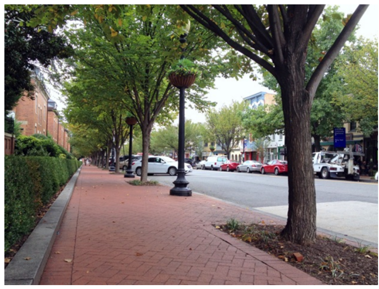
Figure 1. The Barracks Row elm corridor, 10 years post-planting, Fall 2013. October 2013

One major planting in this initiative, Barracks Row (Figure 1), was part of the continued rehabilitation of a dilapidated commercial corridor on Capitol Hill. The 88 American elms planted in the neighborhood were part of an $8.5-million investment largely organized by the Barracks Row Main Street Association. Cooperative development along the 8<sup>th</sup> Street SE corridor also included brick sidewalks, lights, signs, angle-in parking, and water-permeable tree planting strips.